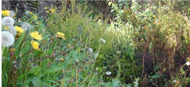
Mixtures of Weeds and Over- Grown Grasses